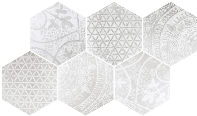
Esagono Ars (6 different patterns packaged randomly at 11pcs/box)